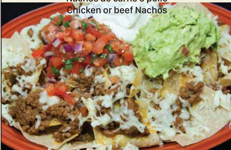
Nachos de carne o pollo Chicken or beef Nachos