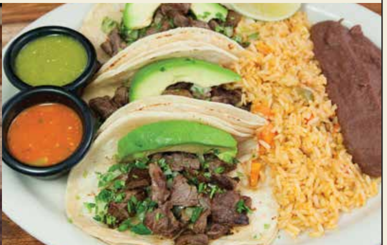
Tacos Steak Tacos