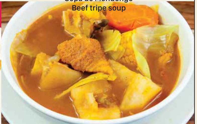
Sopa de Mondongo Beef tripe soup