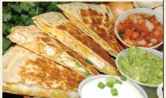
Pollo con Tajadas