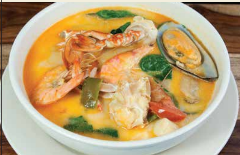
Sopa de Mariscos Seafood Soup