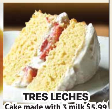
TRES LECHES Cake made with 3 milk $5.99