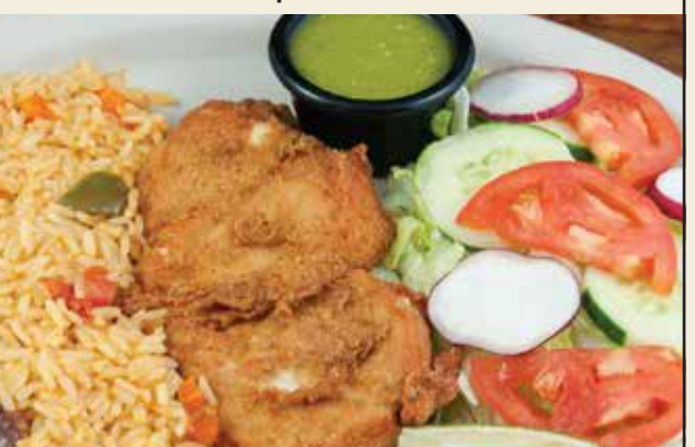
Pan con Pollo